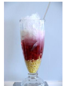
Coco. Milk w/Pomegranate