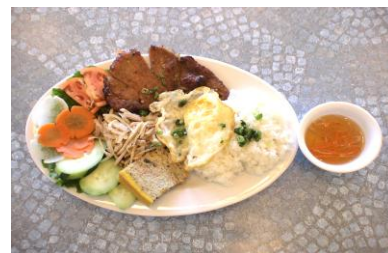
Grilled Pork Chop petite-rice dish