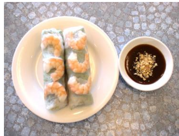
(Soft) Summer Rolls