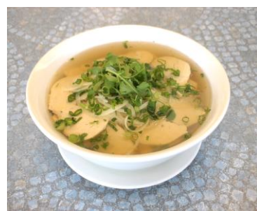
Healthy Chicken Noodle Soup