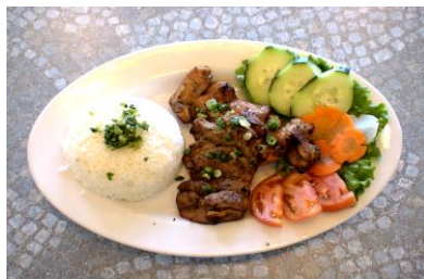
Grilled Lemon Chicken rice dish