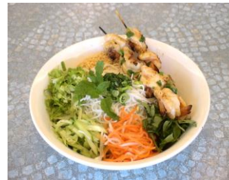
Vermicelli w/Grilled Large Shrimps