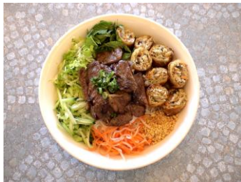
Vermicelli w/Grilled Pork & Crispy Springrolls