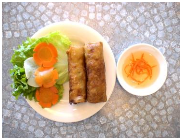
(Fried) Crispy Spring Rolls