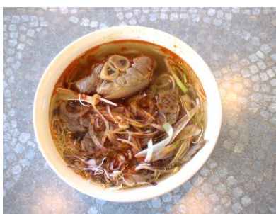
Hot & Spicy Beef Noodle Soup