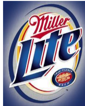
Miller Lite $3.98

Notes: These prices are effective as of Jan 10th, 2019. Prices & items herein are subject to change without any notice. We all thank you for your business, and we are pleased to welcome any friendly comment or suggestion to Pho 98 Restaurant. Bon appetite!