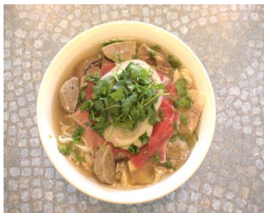
Delicious PHO 98 Number 1