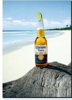
Corona Extra (Mexico)